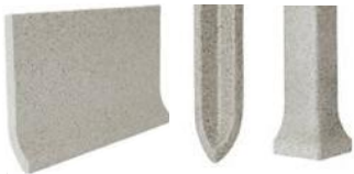
4 INCH TALL FLUSH-FIT, FLAT-TOP COVE BASE